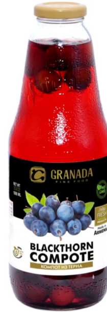
■ Blackthorn Compote 6x1000ml (AG013)