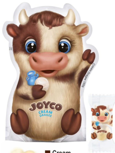
■ Cream Dragee 20x150g (GC002)