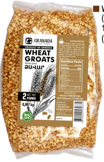
Wheat Groats (Dzavar) 12x970gr (CT004)