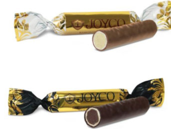
Chocolate Covered Vanilla and Chocolate Wafer Rolls 1x4,41Lb (GC012)