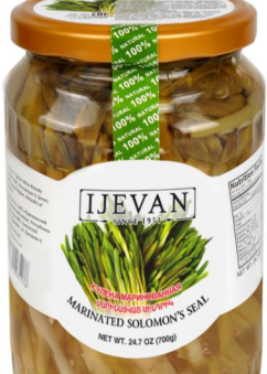
■ Solomon's Seal marinated 6x700g (IJ051)