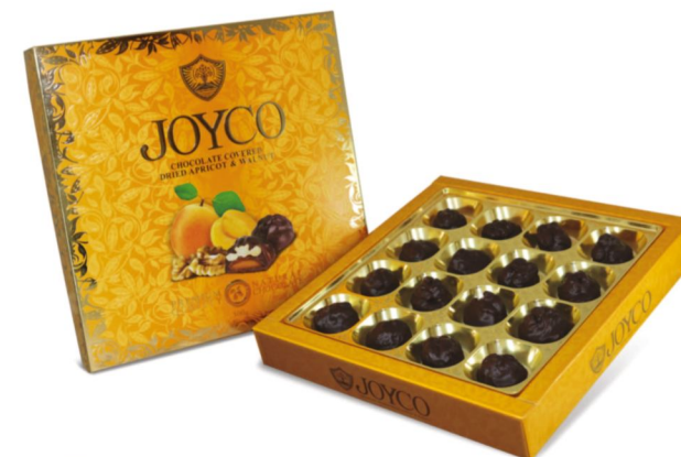
■ Chocolate Covered Dried Apricots with Walnuts 8x300g (GC017)