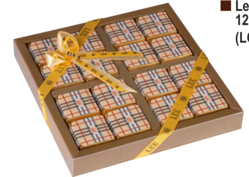
■ Lee Burberry 12x300g (LC007)