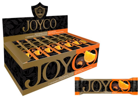
Chocolate Bar with Orange Flavoured Filling 42x50g (GC025)