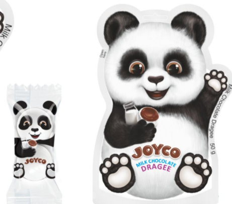
■ Milk Chocolate Dragee 50x50g (GC007)