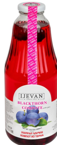
■ Blackthorn compote 6x1000ml (IJ047)