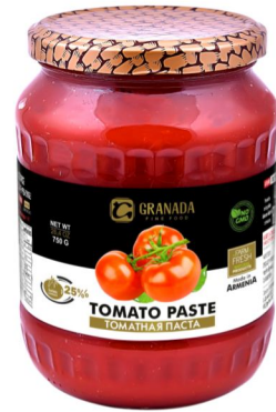
■ Tomato Paste 8x750gr (AG001)