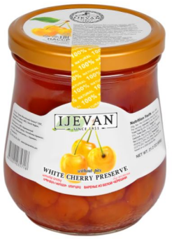
■ White Cherry preserve 8x600g (IJ010)