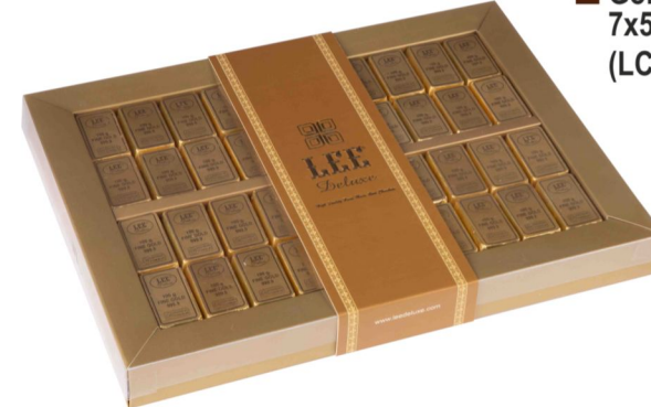
■ Golden Ounce 32 7x590g (LC003)