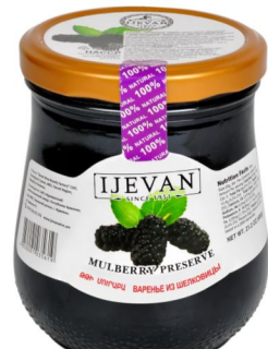
■ Mulberry preserve 8x600g (IJ008)