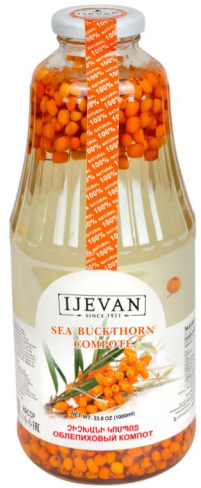
■ Sea Buckthorn compote 6x1000ml (IJ014)