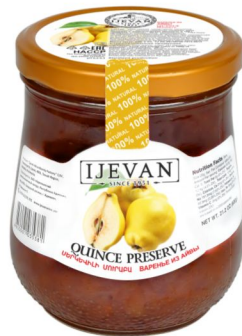
■ Quince preserve 8x600g (IJ039)