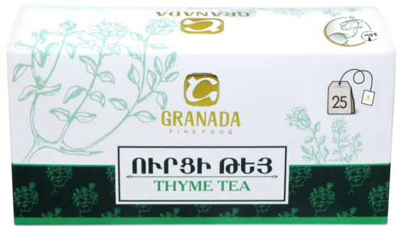
Thyme tea 24x25Tbags (CT010)