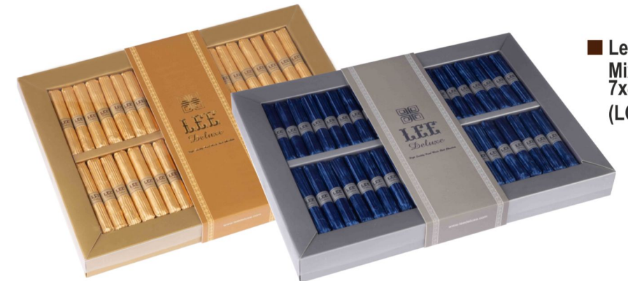
■ Lee Cigar 32pc Mixed colors 7x430g (LC005)

LEE ® Deluxe High Quality Real Chocolate