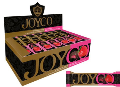
Chocolate Bar with Strawberry Flavoured Filling 42x50g (GC027)