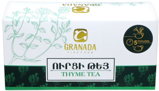
Thyme tea 24x30g (CT002)