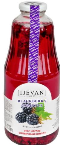
■ Blackberry compote 6x1000ml (IJ026)