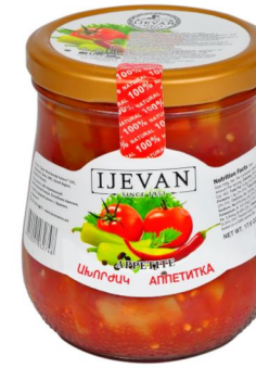
■ Appetite 8x500g (IJ034)