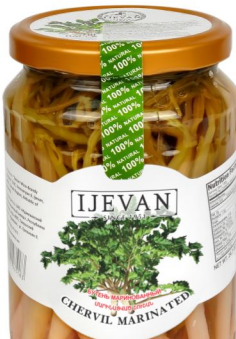
■ Chervil marinated 6x700g (IJ024)