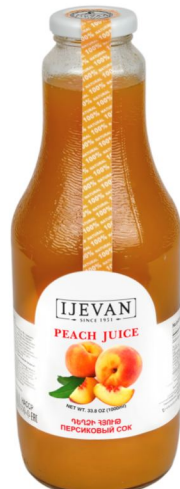
■ Peach juice 6x1000ml (IJ046)