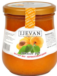
■ Apricot jam 8x600g (IJ004)