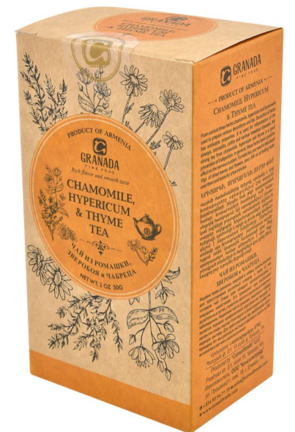
Chamomile, Hypericum & Thyme Tea 24x30g (CT016)