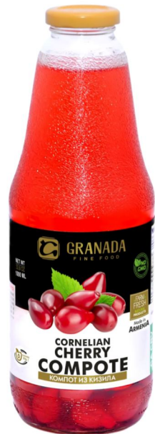
■ Cornelian Cherry Compote 6x1000ml (AG007)