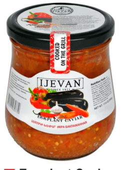
■ Eggplant Caviar 8x500g (IJ013)