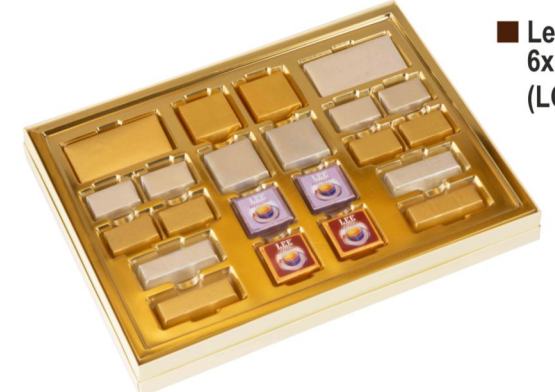
■ Lee Melodia 6x375g (LC002)