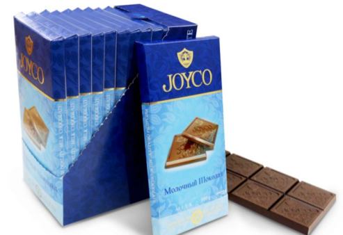
■ Chocolate Bar Milk 12x100g (GC029)