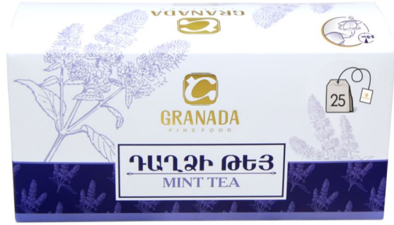
Mint tea 24x25Tbags (CT011)