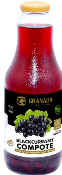
■ Blackcurrant Compote 6x1000ml (AG012)