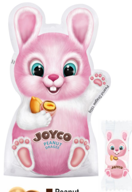
■ Peanut Dragee 20x150g (GC004)