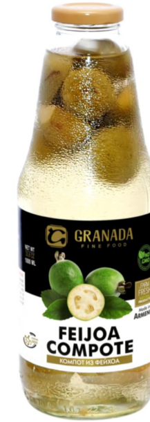
■ Feijoa Compote 6x1000ml (AG014)