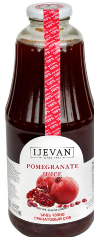
■ Pomegranate juice 6x1000ml (IJ030)