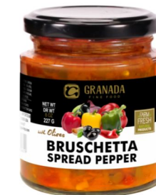
■ Bruschetta spread pepper with Olives 12x8oz (GA004)