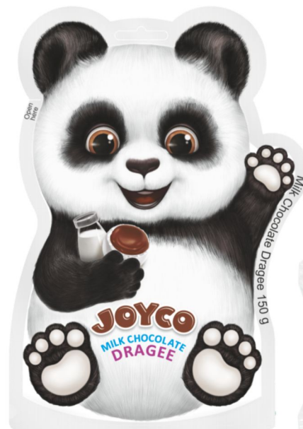
■ Milk Chocolate Dragee 20x150g (GC006)