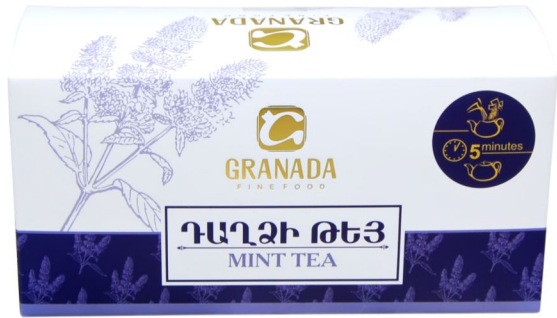
Mint tea 24x20g (CT001)