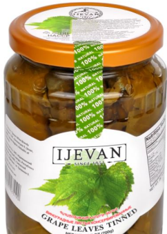
■ Grape Leaves tinned 6x700g (IJ033)