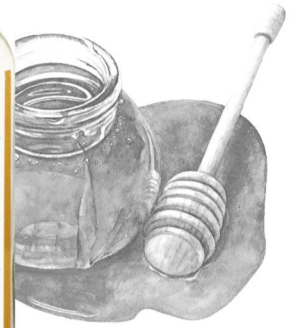
Honey Vinegar 12x500ml (AN003)