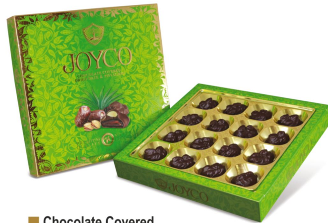
Chocolate Covered Dried Dates with Pistachios 8x340g (GC022)