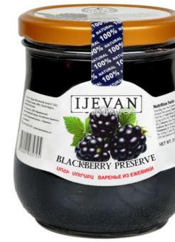
■ Blackberry preserve 8x600g (IJ037)