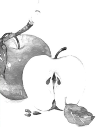
Apple Cider Vinegar 12x500ml (AN002)