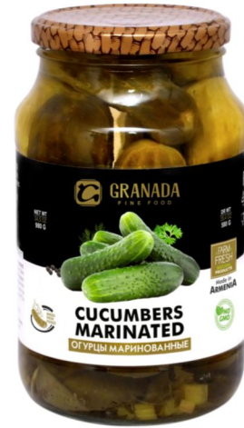
■ Cucumbers Marinated 6x980gr (AG017)