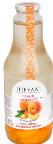
■ Peach compote 6x1000ml (IJ041)