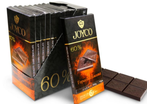
■ Chocolate Bar Dark 60% 12x100g (GC028)