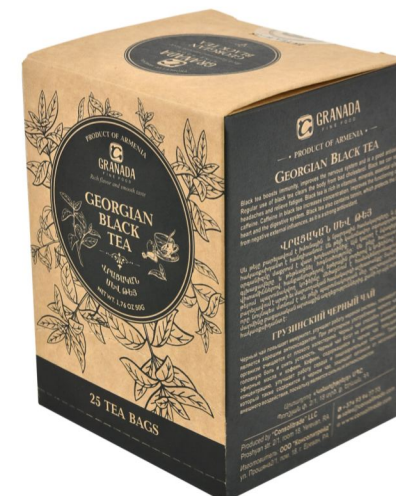
Georgian Black Tea 24x25Tbags (CT017)