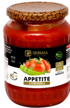
■ Appetite 8x720gr (AG023)