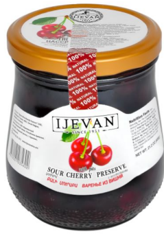
■ Sour Cherry preserve 8x600g (IJ009)