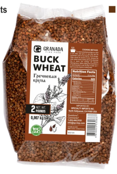
Buckwheat (Grechka) 12x970gr (CT005)