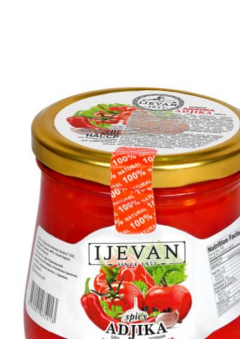
■ Adjika spicy 8x500g (IJ049)