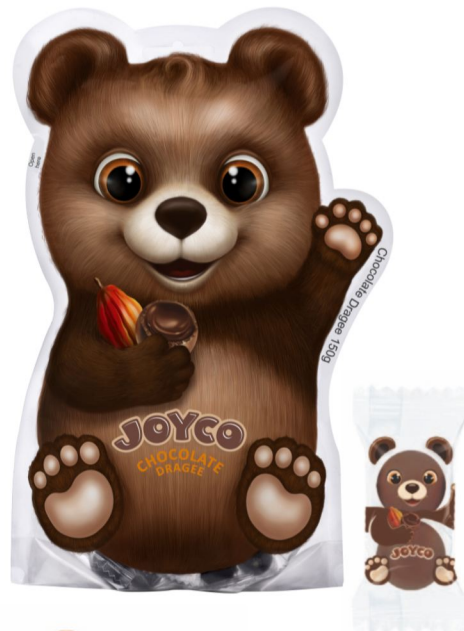
■ Chocolate Dragee 20x150g (GC005)