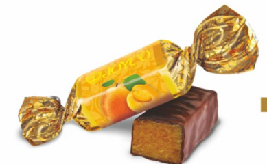
Chocolate Covered Dried Apricots 1x4,41# (GC035)