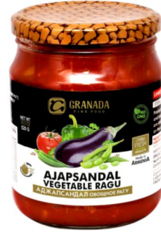
■ Ajapsandal Vegetable Ragù 8x520gr (AG020)