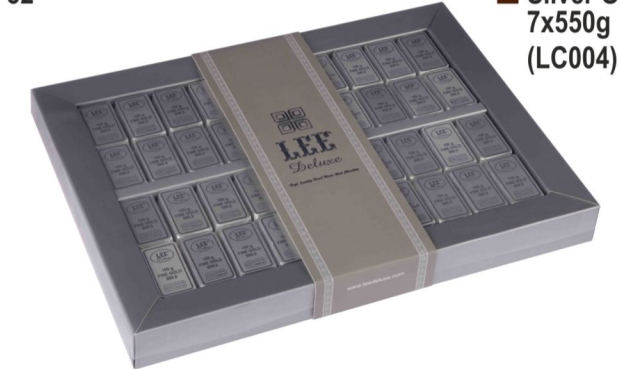
■ Silver Ounce 32 7x550g (LC004)

LEE ® Deluxe High Quality Real Chocolate