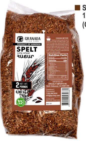
Spelt (Ajar) 12x970gr (CT007)