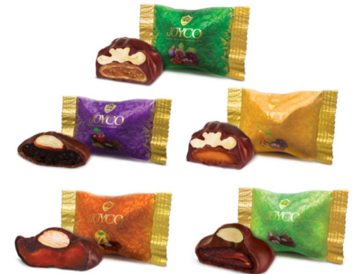
Chocolate Covered Dried Fruits 1x4,41Lb (GC013)