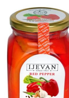
■ Red Pepper preserve 6x800g (IJ028)