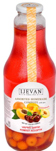
■ Assorted Homemade compote 6x1000ml (IJ040)