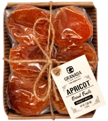
Sun dried Armenian Apricot 200gr