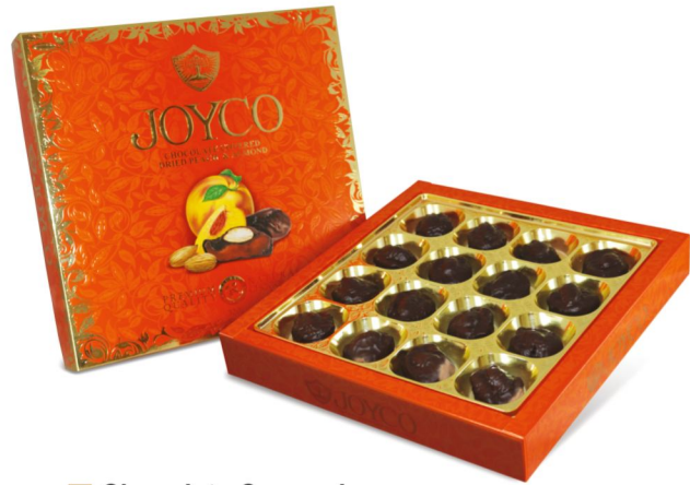
Chocolate Covered Dried Peaches with Almonds 8x320g (GC019)