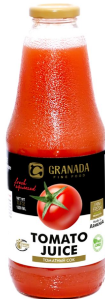
■ Tomato Juice 6x1000ml (AG010)