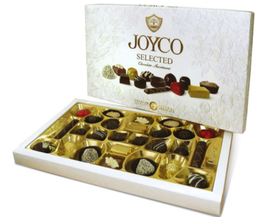
■ Chocolate Assortment Collection 8x300g (GC016)