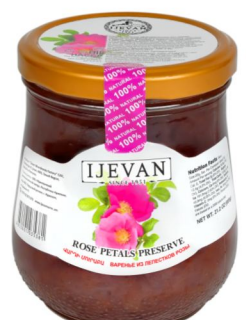
■ Rose Petals preserve 8x600g (IJ007)