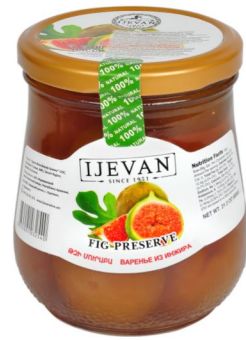
■ Fig preserve 8x600g (IJ002)