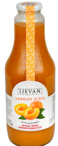
■ Apricot juice 6x1000ml (IJ029)