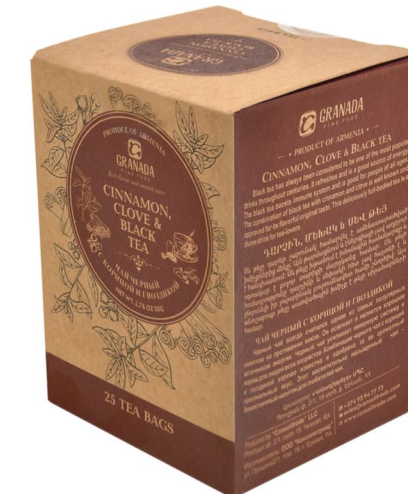
Cinnamon, Clove & Black Tea 24x25Tbags (CT013)