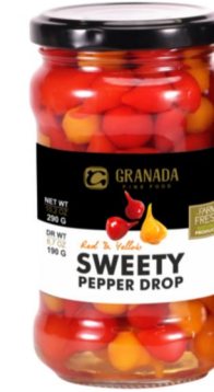
■ Sweet pepper drop red & yellow 12x10,2oz (GA002)