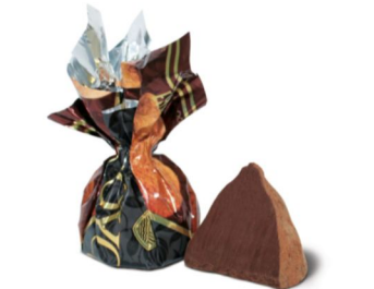
Truffles Bulk 1x4,41Lb (GC023)