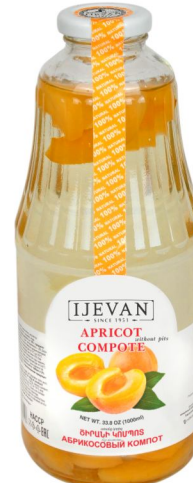
■ Apricot compote 6x1000ml (IJ032)