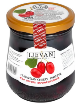
■ Cornelian Cherry preserve 8x600g (IJ038)