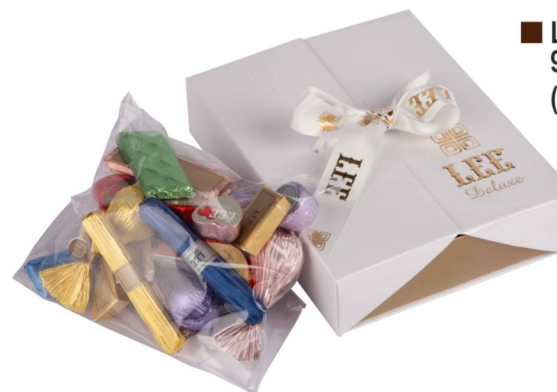
■ Lee Elite 9x400g (LC006)