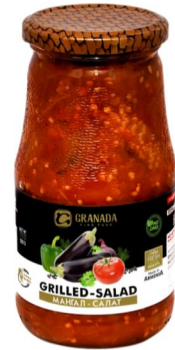
■ Grilled-Salad 8x500gr (AG021)