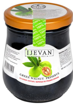
■ Green Walnut preserve 8x600g (IJ001)