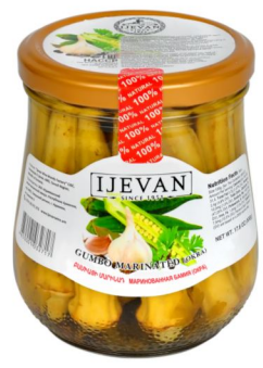
■ Okra marinated 8x500g (IJ036)