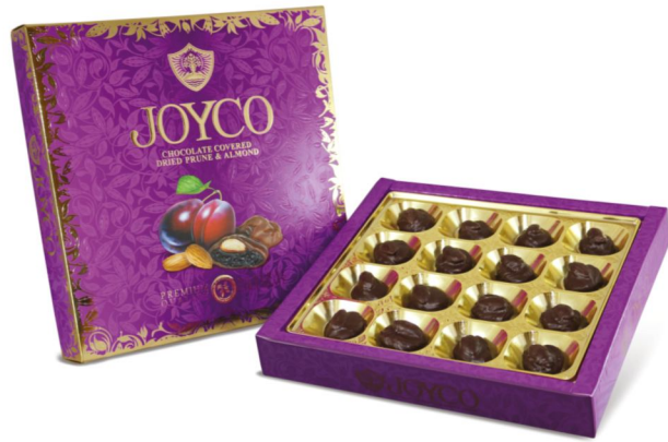
Chocolate Covered Dried Prunes with Almonds 8x280g (GC020)