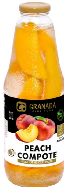
■ Peach Compote 6x1000ml (AG011)