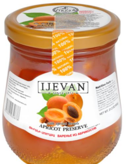
■ Apricot preserve with kernels 8x600g (IJ005)