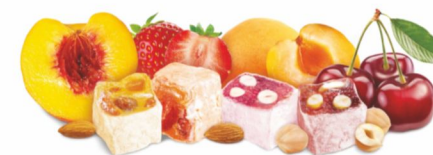
■ Rahat-Lokum With Dried Fruits 8x500g (GC014)