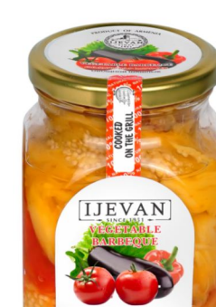
■ Vegetables BBQ 6x800g (IJ027)