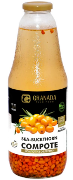
■ Sea-Buckthorn Compote 6x1000ml (AG016)