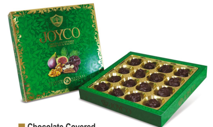
■ Chocolate Covered Dried Figs with Walnuts 8x350g (GC018)