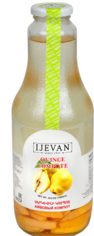
■ Quince compote 6x1000ml (IJ031)