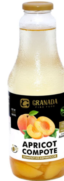
■ Apricot Compote 6x1000ml (AG015)