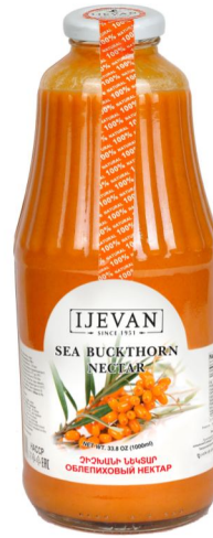
■ Sea Buckthorn nectar 6x1000ml (IJ019)