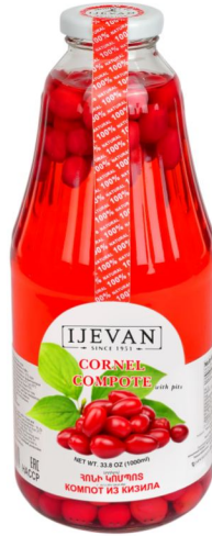
■ Cornel compote 6x1000ml (IJ015)