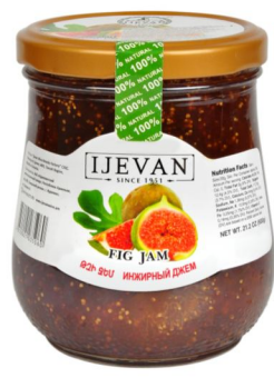
■ Fig jam 8x600g (IJ003)