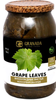
■ Grape Leaves 6x780gr (AG019)