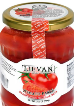
■ Tomato paste 6x700g (IJ050)