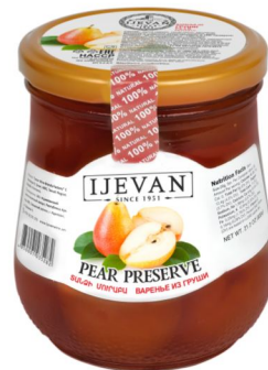
■ Pear preserve 8x600g (IJ045)