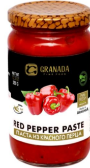
■ Red Pepper Paste 8x350gr (AG025)