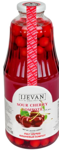
■ Sour Cherry compote 6x1000ml (IJ016)