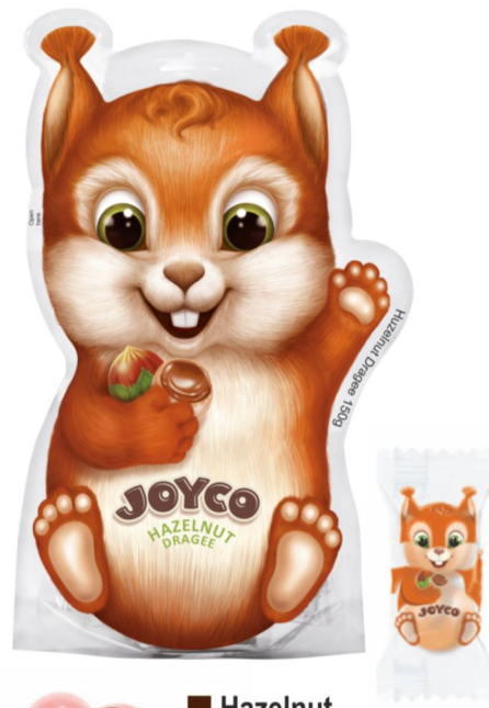
■ Hazelnut Dragee 20x150g (GC003)