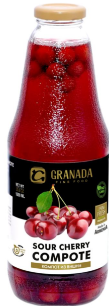
■ Sour Cherry Compote 6x1000ml (AG009)