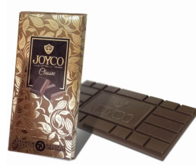
■ Chocolate Bar Classic Dark 12x100g (GC011)