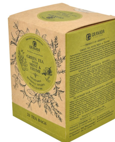
Green Tea with Mint & Thyme 24x25Tbags (CT018)