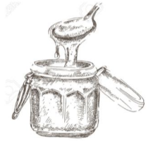
Organic Honey 12x500g (AN001)