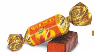
Chocolate Covered Dried Peaches 1x4,41# (GC034)