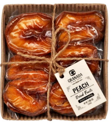
Sun dried Armenian Peach 200gr