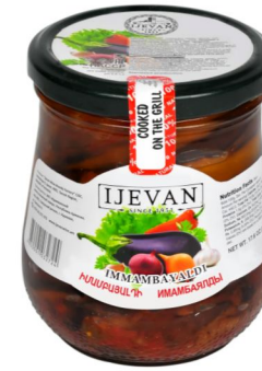
■ Imam Bayaldi 8x500g (IJ035)