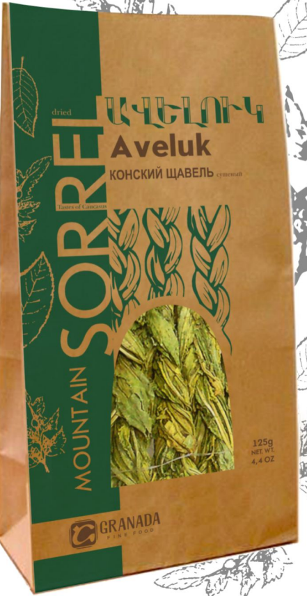
Mountain Sorrel Aveluk 12x125g (CT015)