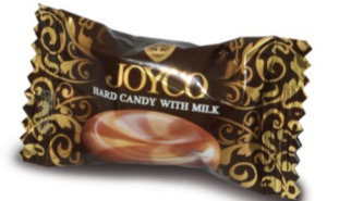
Sugar Hard Candy Milk 1x6,62# (GC032)