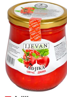
■ Adjika 8x500g (IJ011)