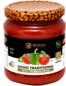
■ Lecho Traditional 8x460gr (AG022)