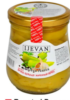
■ Roasted Pepper with garlic 8x500g (IJ012)