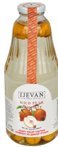
■ Wild Pear compote 6x1000ml (IJ018)