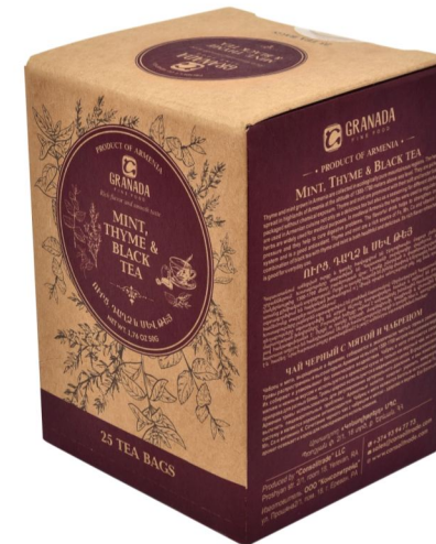
Mint, Thyme & Black Tea 24x25Tbags (CT012)