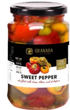
■ Sweet pepper stuffed with Olives & Jalapeno 12x12oz (GA003)