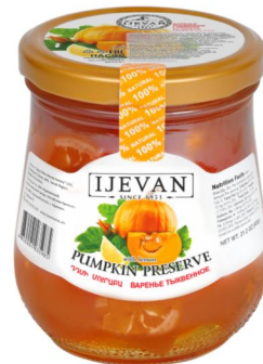
■ Pumpkin preserve with lemon 8x600g (IJ042)