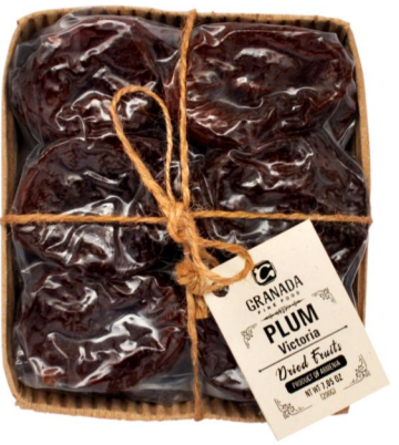
Sun dried Armenian Red Plum (Victoria) 200gr