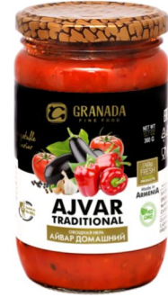
■ Ajvar traditional 8x360g (AG003)