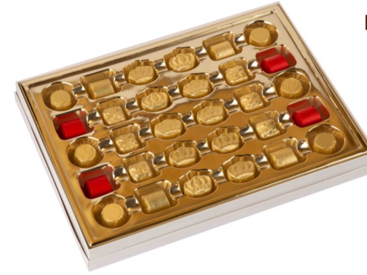
■ Lee Bonita 6x375g (LC001)