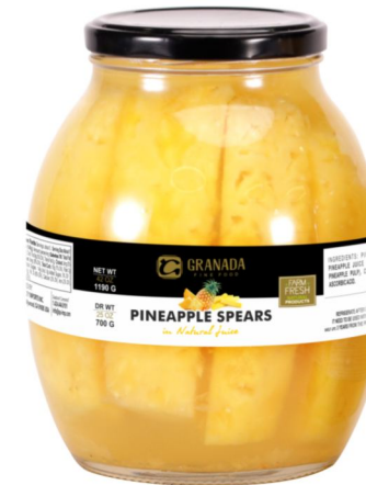
■ Pineapple spears in natural juice 6x45oz (GA006)