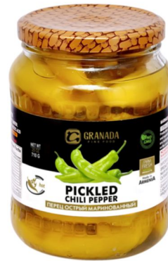
■ Pickled Chili Pepper 8x710gr (AG024)