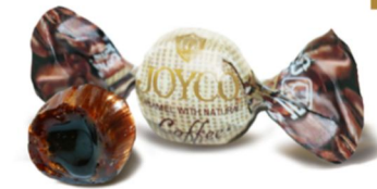
Hard Candy with Coffee Filling 1x6,62# (GC030)