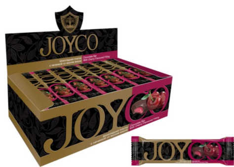
Chocolate Bar with Cherry Flavoured Filling 42x50g (GC026)