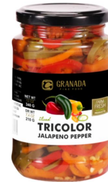
■ Tricolor Jalapeno pepper sliced 12x12oz (GA001)